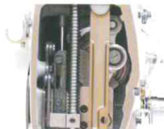
头部无油 清洁缝制 Dry Head System