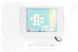
多种花样选择 升级方便 Patterns are Easy to Update