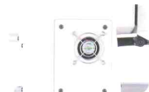
散热系统 低温耐用 Cooling System, Long Durability